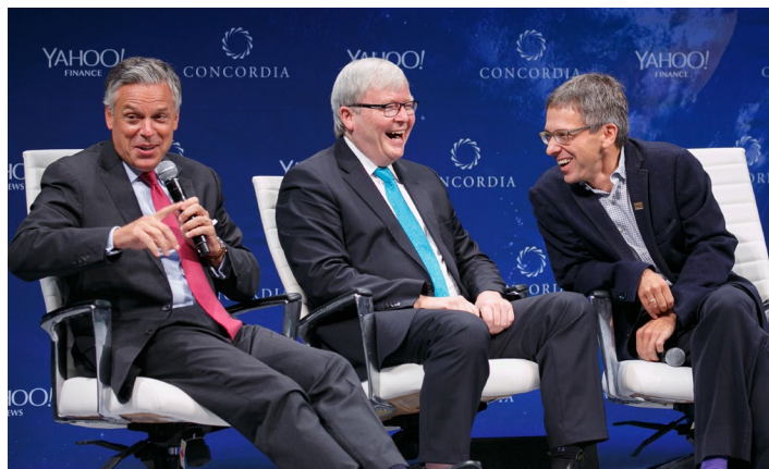
KEVIN RUDD, FORMER PRIME MINISTER OF AUSTRALIA; AMB. JON HUNTSMAN JR., CHAIRMAN OF THE ATLANTIC COUNCIL; AND DR. IAN BREMMER, PRESIDENT AND FOUNDER OF EURASIA GROUP EXPLORED THE COMPLEX DYNAMICS OF THE U.S.-CHINA RELATIONSHIP ON THE CONCORDIA STAGE.

notably: trade, security, and shared interests in the Middle East. Dr. Bremmer remarked that China will be the largest economy in the world, and when it is, the level of uncertainty around its trajectory will be greater than anything we have experienced with any major power in our lifetime. He concluded that the impact this will have on strategic thinking and decision-making for Americans and U.S.-based multinationals is "immense and hasn't yet been factored in."