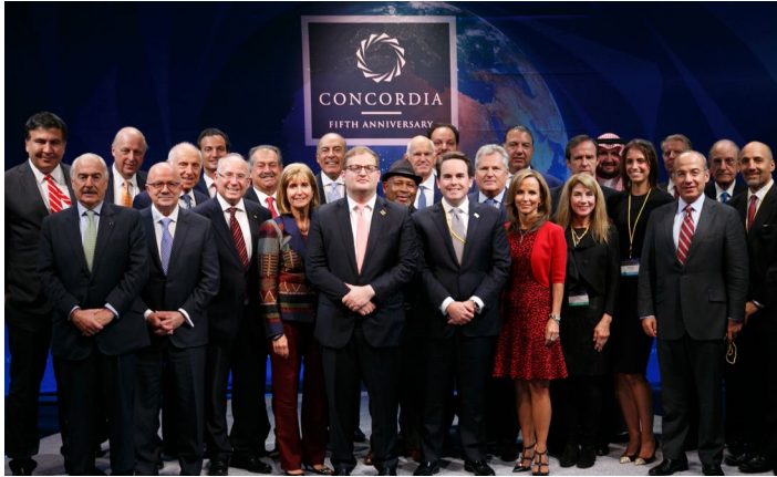
CONCORDIA'S LEADERSHIP COUNCIL ASSEMBLED AT THE 2015 SUMMIT FOR ITS ANNUAL MEETING.