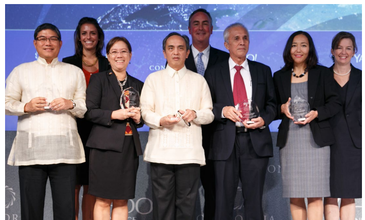
TV WHITE SPACE ANNOUNCED AS THE 2015 P3 IMPACT AWARD WINNER.